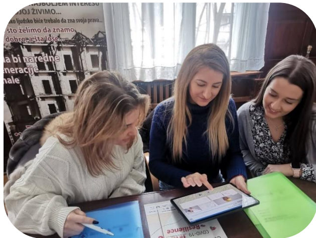
I-CCC Diary: Getting familiar with the tablet-based tool to support clients with dementia.